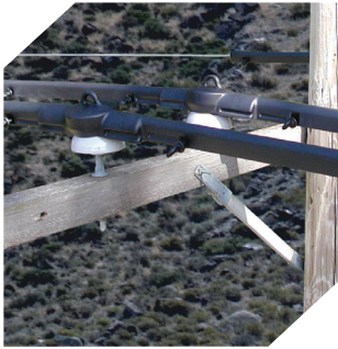
RPC-0800 (Black) Single Support