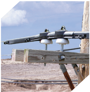
RPC-0800 (Black) Double Support