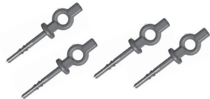
Round Eye Lock Pins - RPP-0840