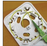
Pigtail Storage in COYOTE Fiber Wall Plate