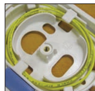
Pigtail Storage in COYOTE Splice and Store Fiber Wall Plate