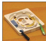
COYOTE Splice and Store Fiber Wall Plate Base