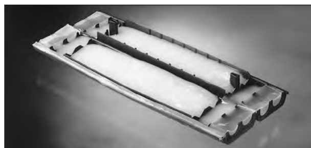
25-Pair In-line, Cat. No. 8006508 50-Pair In-Line/Butt Version, Cat. No. 8006681

Cables ranging from 22 to 26 gauge are held securely inside the BLACK-JACK 25-Pair and 50-Pair Cable Closure. The features on the top closure half exert pressure on the cables to keep them centered. The features on the bottom closure half allow the closures to adjust for a range of cable diameters. The bonding bridge(s) included with the kits prevent cable pull-out. Closing clamps are used to hold halves together.