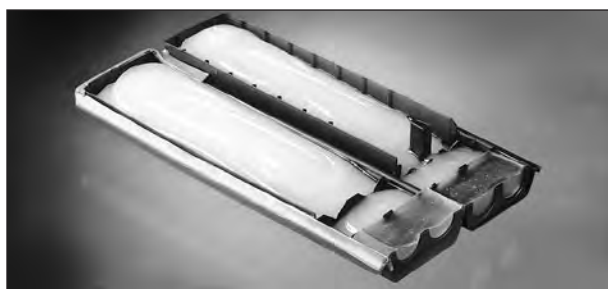
25-Pair Butt Version, Cat. No. 8006318