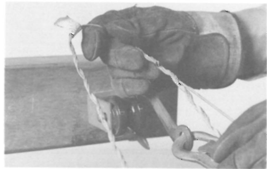
3. Completely apply either leg to wire by rotating the leg out and away from wire.