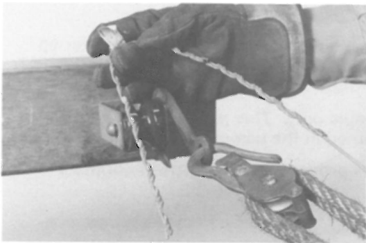
4. First leg completely applied.