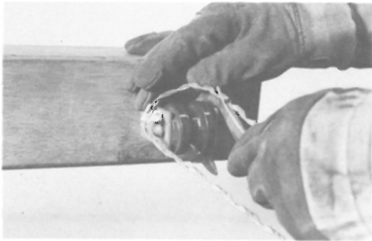
2. Tension wire properly and match loop of dead-end to insulator.