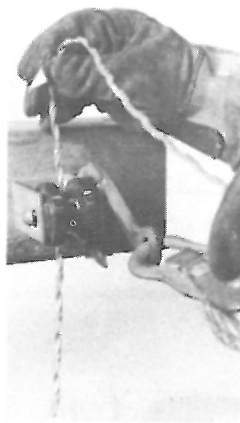
5. Insert free leg of dead-end.....