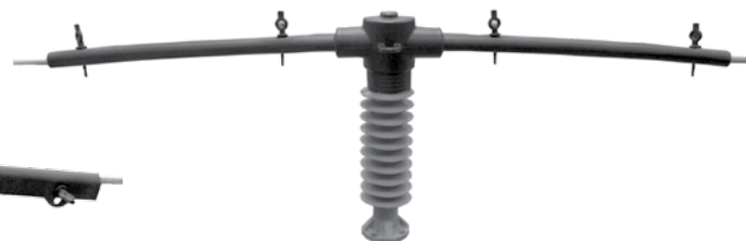
Horizontal Post – Top View