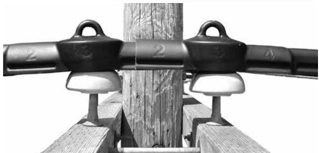
RPC-0800 – Double Support