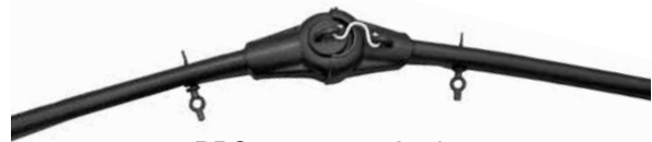
RPC-0810 – 30° Angle