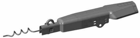
Small Conductor Applications

Materials: The RAPTOR PROTECTOR is manufactured from low density polyethylene (LLDPE) possessing excellent environmental stress crack resistance and is fully UV stabilized.