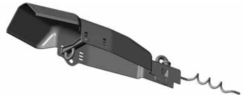
Large Conductor Applications