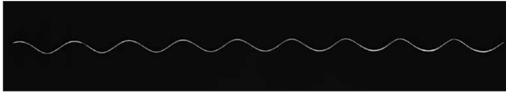
PREFORMED™ LASHING ROD

Be sure to read and completely understand this procedure before applying product. Be sure to select the proper size PREFORMED™ product before application.