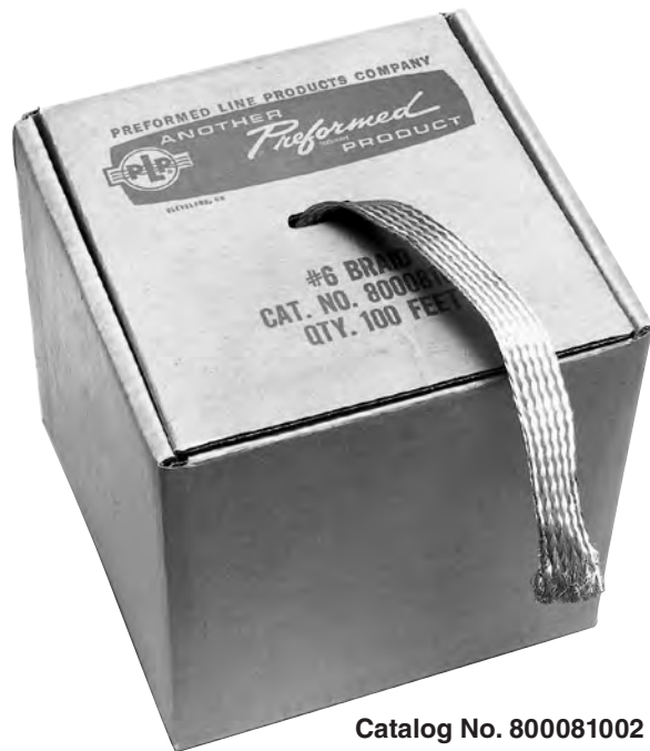
Catalog No. 800081002