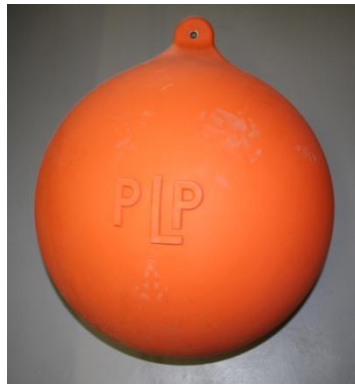
Aircraft warning sphere

The Preformed Line Products AIRCRAFT WARNING DEVICE has been designed to be applied by hand or by hot stick. Assembly requires an aircraft warning sphere and a helical tie.