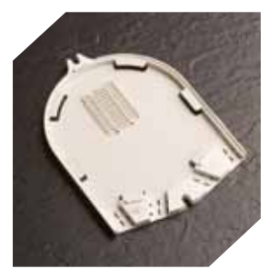
80807701 Splice Tray