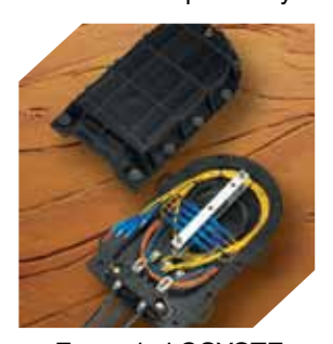
Expanded COYOTE RUNT Cross-Connect